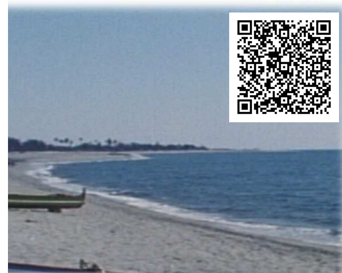
The beach of Botolan

I am telling you the truth: a grain of wheat remains no more than a single grain unless it is dropped into the ground and dies. If it does die, then it produces many grains. (John 12:24)